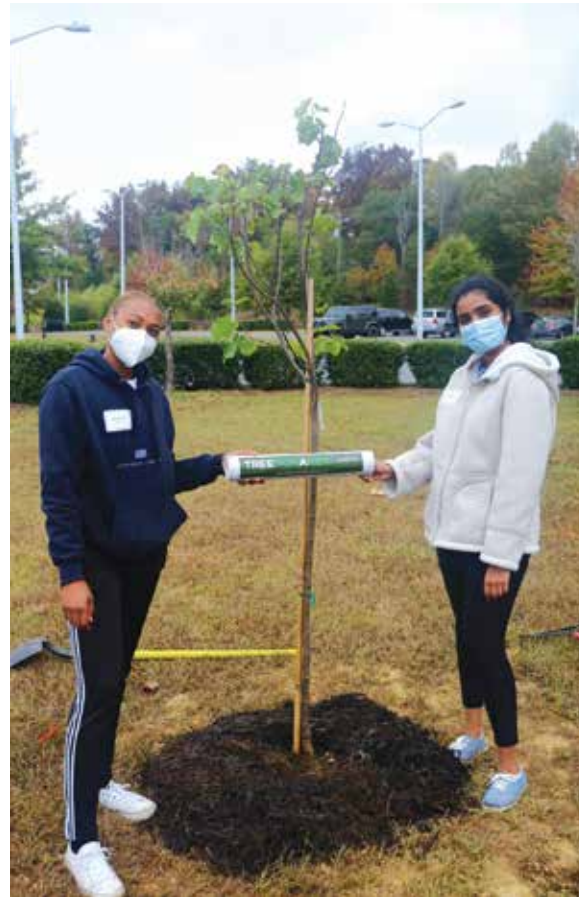
Since 2012, Crescent Communities has sponsored 9 TreesCharlotte events, including the October 2021 TreeDay planting at Whitewater Middle School and Whitewater Academy.

The work that TreesCharlotte has done to maintain the tree canopy in our community is critical to the quality of life promised by the greater Charlotte area. As more people from around the country and around the world discover the myriad reasons the Queen City is a great place to live, we must accommodate growth. With growth often comes a few undesired consequences, but by applying principles of thoughtful development that are sensitive to the land, and by working with TreesCharlotte to protect the quality of the existing trees and augment the tree