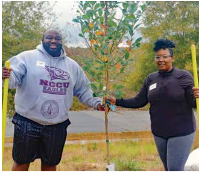
The Whitewater Middle School TreeDay in October 2021 added 120 new trees to the campus of the school.

Planning and planting for the future! We will be busy this fall. The fall 2022 calendar has been set and features