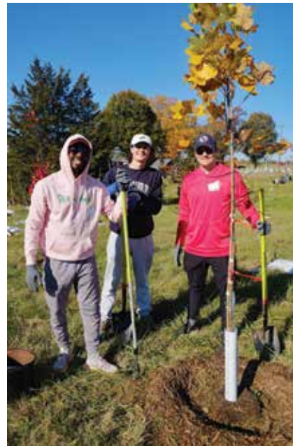
200 trees were added to back Creek Church on a sunny November morning thanks to volunteers and generous sponsorship by Trammell Crow, in partnership with Arbor Day Foundation, and TIAA.