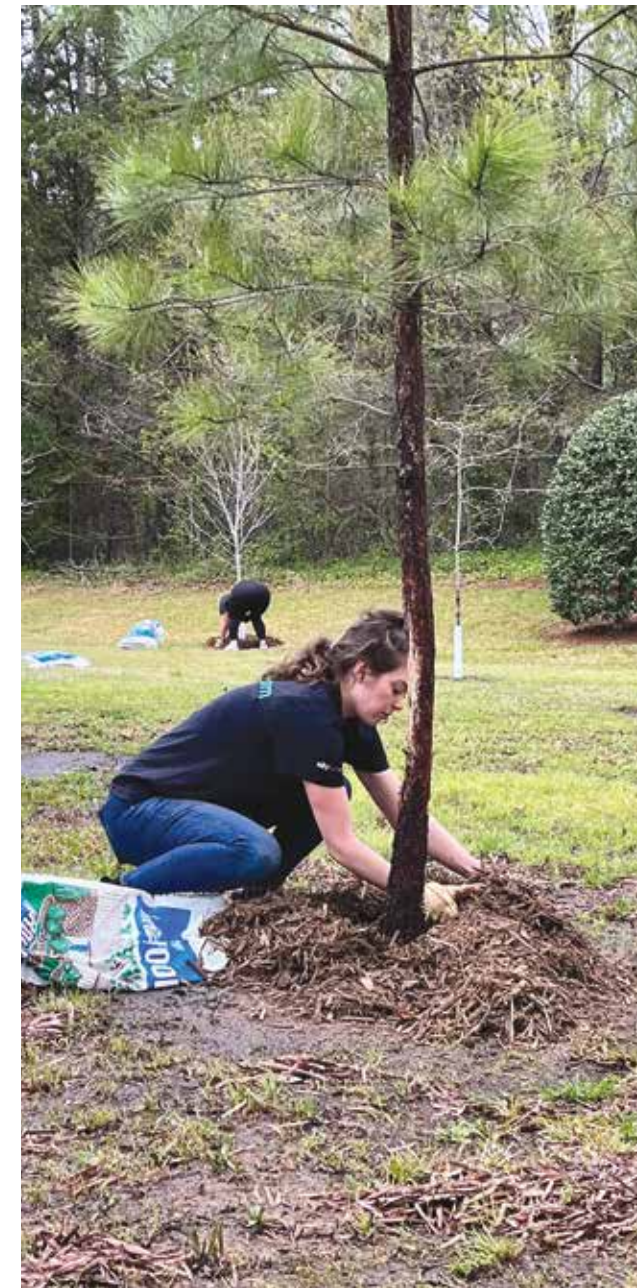
A TreeCare day at McClintock Middle school in April 2022 provided fresh mulch for 301 previously planted TreesCharlotte trees.

10 Camp Greene/Historic 4th Ward CommunityWoods