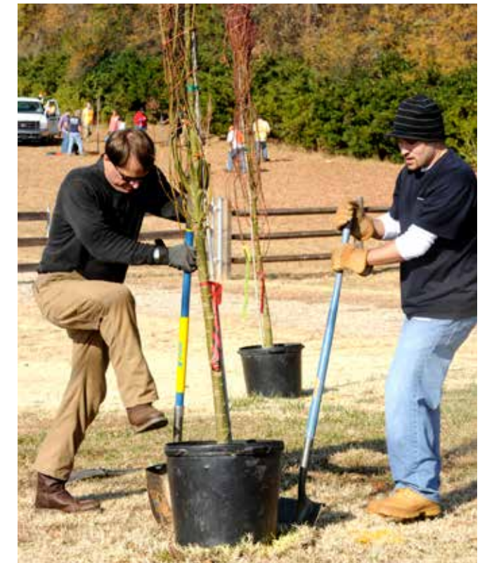
Volunteers help plant trees during our very first planting at a school in 2012.