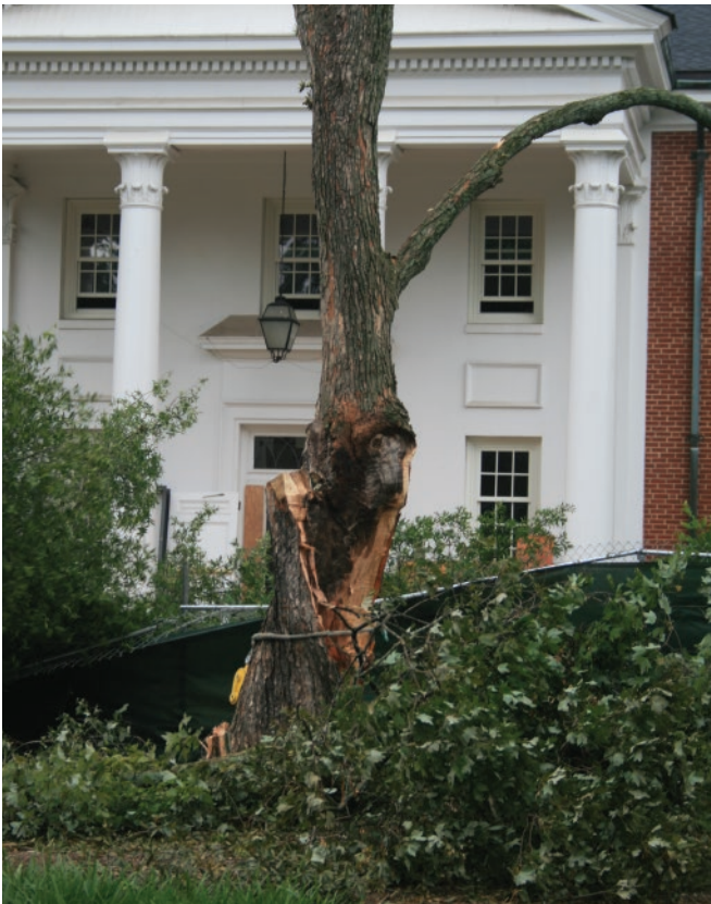
Bark growing between two main stems (leaders) led to this failure during a storm. Proper pruning when the tree was young could have prevented this from happening.