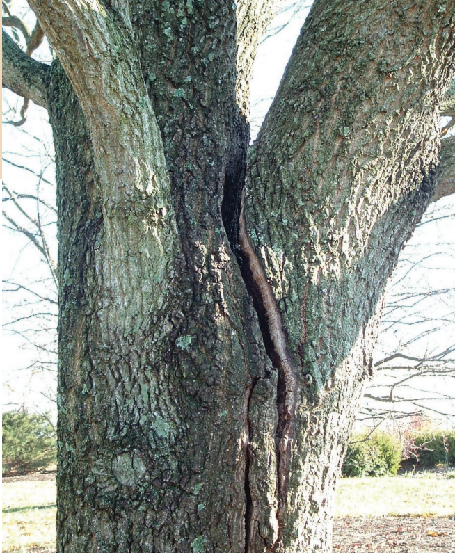
Crack formed where two main stems (leaders) grew from the same point. Pruning early in the tree's life could have prevented this.