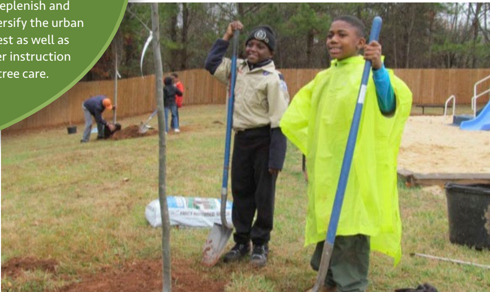
Carolinas HealthCare System volunteers

Planting focus areas include: Residential subdivisions, Parks and nature preserves, Charlotte Housing Authority campuses, CMS campuses, faith community campuses as well as city streets